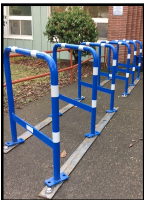
New bike racks at Astor!