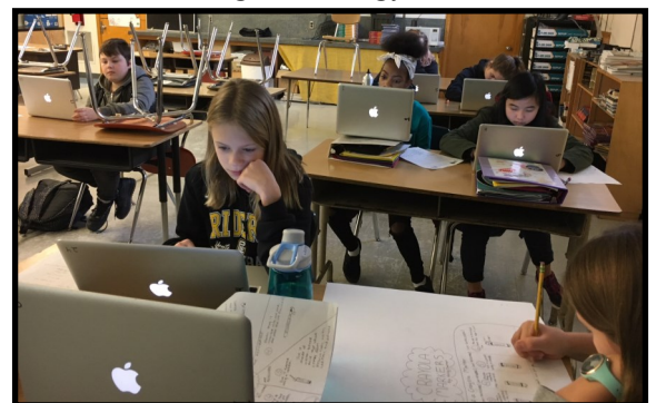
Using technology in Science class