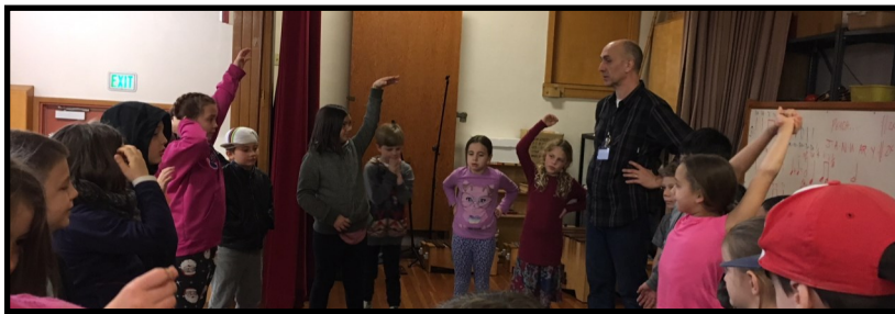
Learning about Rhythm in Music