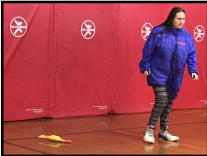
Newton's First Law of Inertia in STEM class.